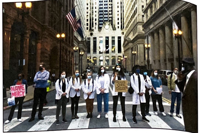
Mercy Hospital staff brought the fight to keep the facility open to LaSalle Street to make more Chicagoans aware of the hospital's plight.

A Mercy/Trinity spokesperson participated in a public hearing in mid-January about opening the new Mercy Care Center. The IHFSRW turned down the