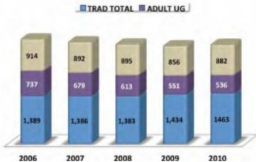
FALL ENROLLMENT BY GROUP